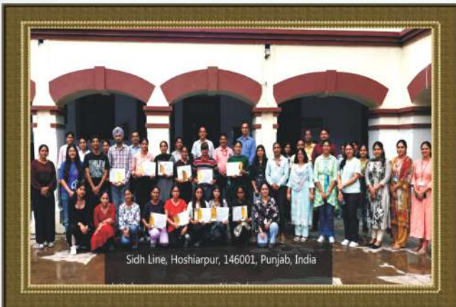
Inter-Departmental Activity titled 'Brain Wave-Green Board Battle'