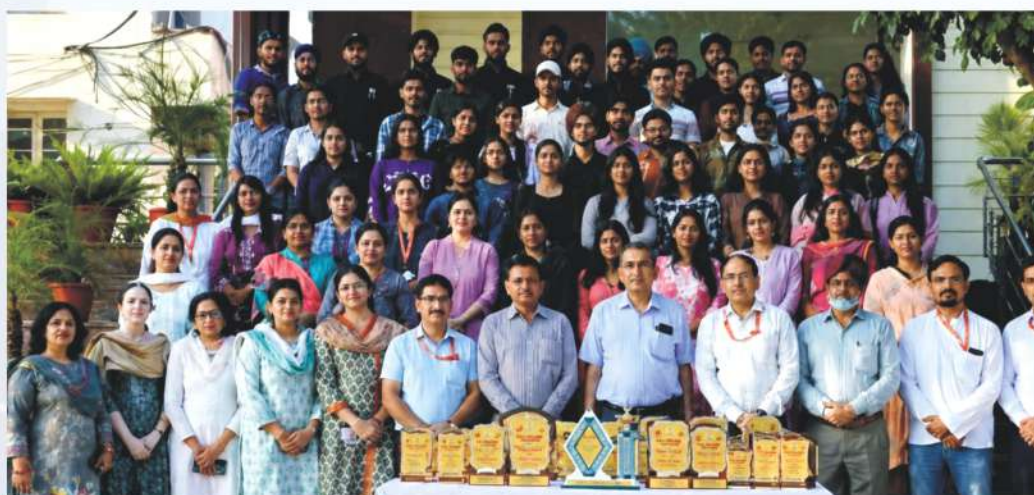
College wins 1st Runner-Up Trophy in PU Zonal Youth and Heritage Festival