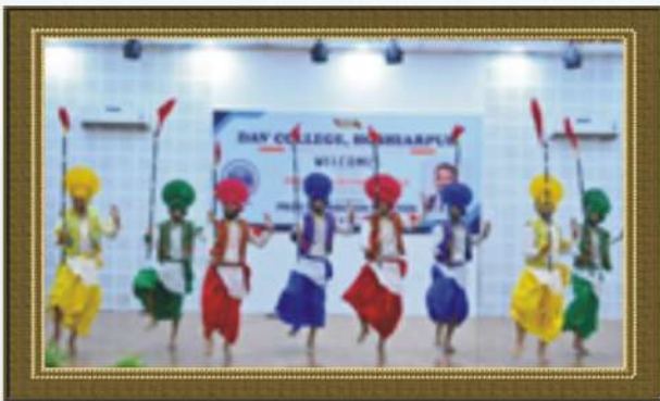
Bhangra Performance by Students