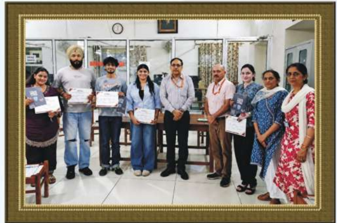
Celebration of National Librarian's Day