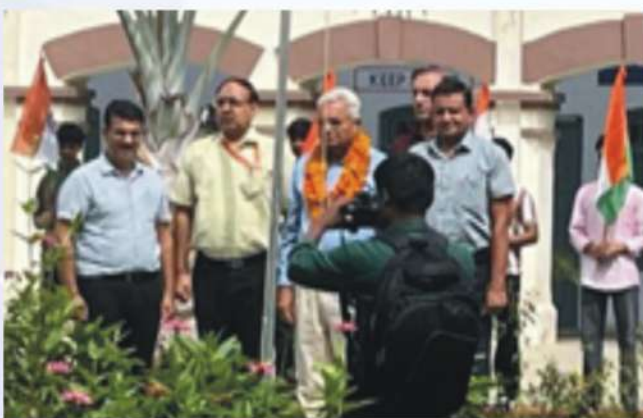
Celebration of Independence Day