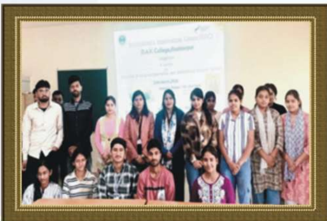
Lecture on 'Blueprints of Progress : Innovation & Institutional Support Systems'