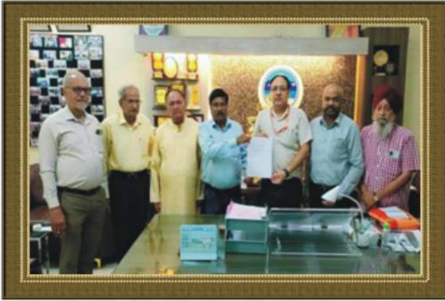
MoU with Rotary Eye Bank and Corneal Transplantation Society, Hoshiarpur to Promote Eye Donation