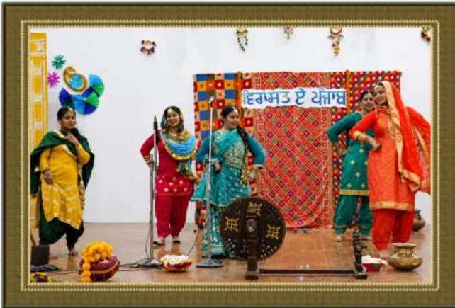
Celebration of Virasat e Punjab