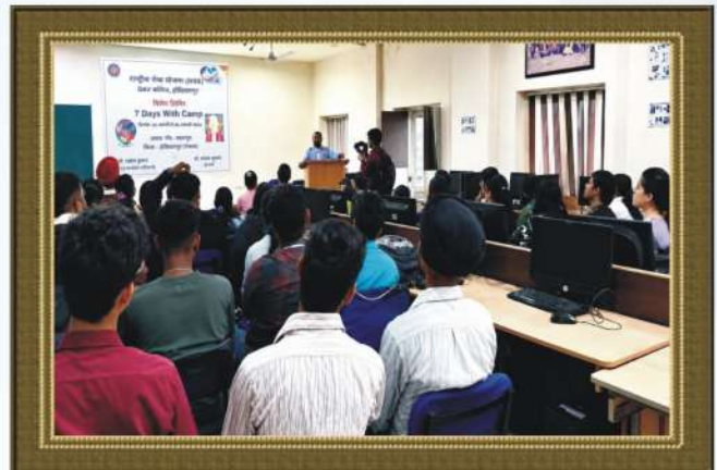
Lecture on 'Beyond Social Media : Endless Possibilities for Innovation'