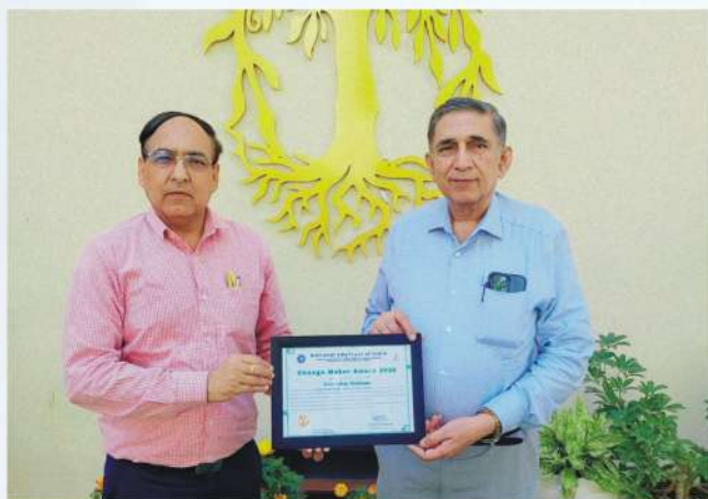
National Change Maker Award from National Education Trust of India

Established in 2004, and affiliated to Punjab School Education Board, DAV Collegiate Senior Secondary School provides instruction in Humanities, Commerce, Medical and Non-Medical Streams. All facilities available to college students are also provided to the students of Collegiate School. The School shows excellent results every year and, as a result thereof, students succeed in getting admission in reputed institutions every year. A new state of the art building, Principal Major Rajkumar Memorial Block has been built in the campus to house the Collegiate School.