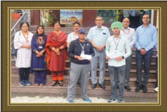
Recipients of Sh. Harjinder Parkash Memorial Scholarship and Ch. Khushal Singh Memorial Scholarship