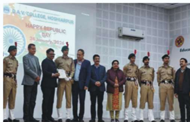
Celebration of Republic Day