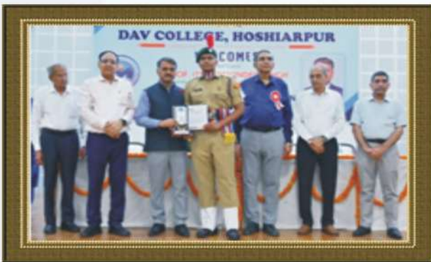
Felicitation of Prize Winners