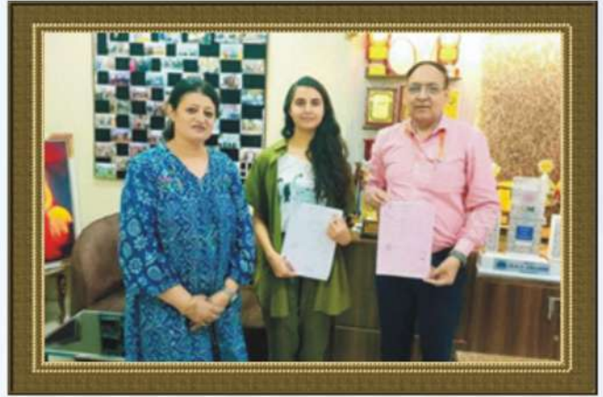
MoU with 'Beyond the I' Trust Foundation, an active non-government organization for Environmental Protection