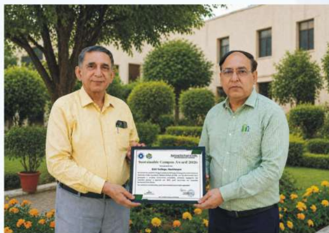
Sustainable Campus Award 2026 from National Education Trust of India