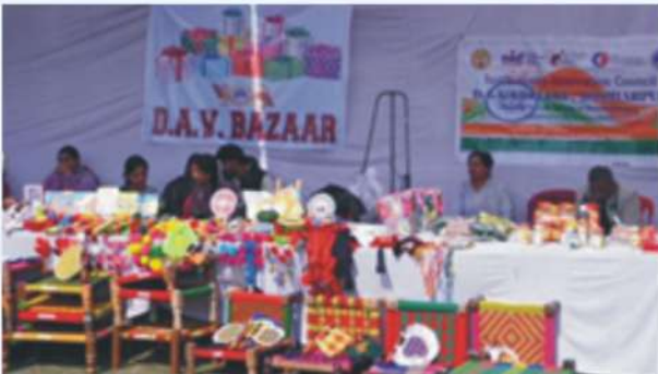
Exhibition Cum Sale of Arts Products