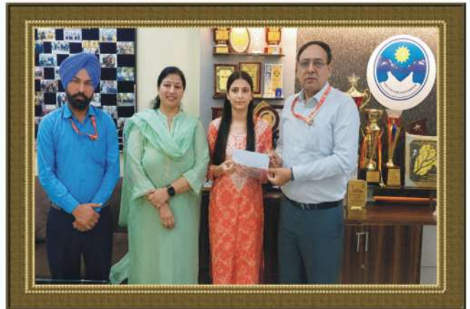
Recipient of Gyani Gurmukh Singh Musafir Scholarship