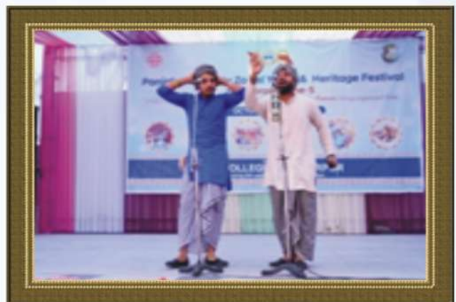
An Act of Bhand