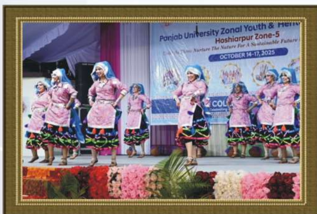
Group Dance Performance