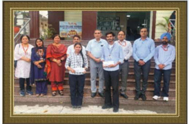
Recipients of Sh. Vijay Kumar Rangra Memorial Scholarship