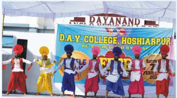
Bhangra Performance at the Culmination of Fete