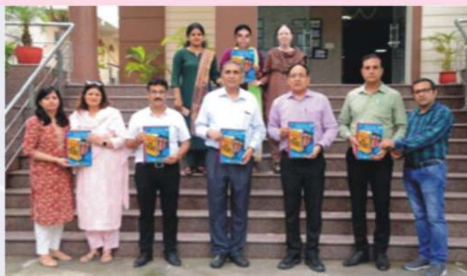
DAV College, Hoshiarpur was ranked among Best Colleges of India for 9th consecutive year by India Today-MDRA