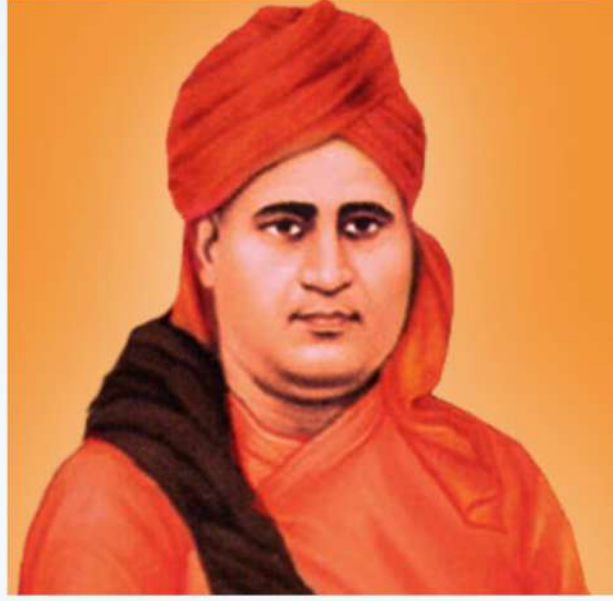
Swami Dayanand Saraswati Ji

ओ३म् भूर्भुवः स्वः तत्सवितुर्वरेण्यं भर्गो देवस्य धीमहि धियो यो नः प्रचोदयात्