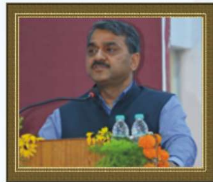
Chief Guest Addressing the Prize Winners