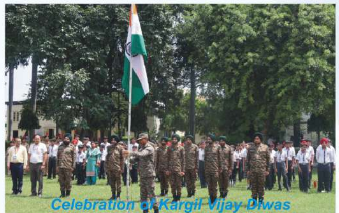
Celebration of Kargil Vijay Diwas

The college offers opportunities for training under the NCC. An NCC Orientation Programme is organized in the beginning of each session to introduce the students to the benefits of joining NCC and also regarding the opportunities available to them to join the armed forces through NCC. Every year a large number of our students enrol themselves and manage to clear 'B' and 'C' certificate exams. Our cadets routinely win laurels at Inter- Group Camps, Pre- Thal Sena Camp and Army Training Camp. During the last