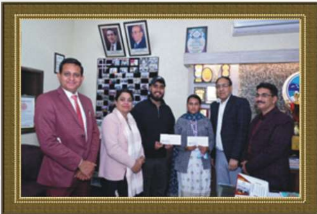
Recipients of Dr. Gurlal Singh and Mrs. Satwant Kaur Memorial Scholarship