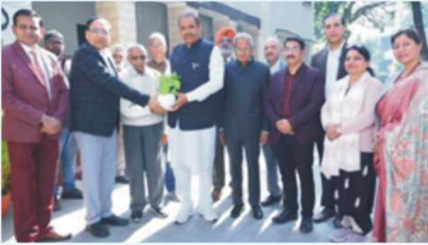
Chief Guest Sh. Vijay Sampla being received in the college